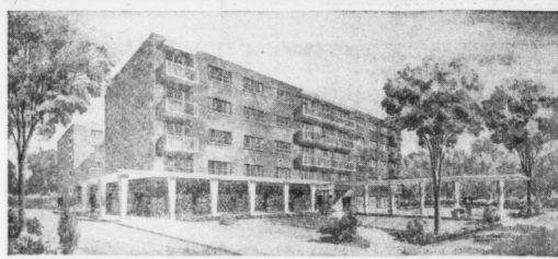
THIS ARCHITECTURAL DRAWING of the men's dormitory now under construction depicts the sleek, ultra modern lines of the building that will offer the best in room and board to UK students in the future.