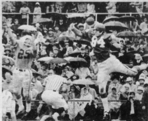
Kernel