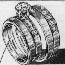
SIGNET 250. Wedding Ring 75. Man's Ring 150.