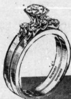
SATURN 350. Wedding Ring 100.

4 WAYS TO BUY: • CASH • BANK CREDIT CARD • CHARGE • LAYAWAY