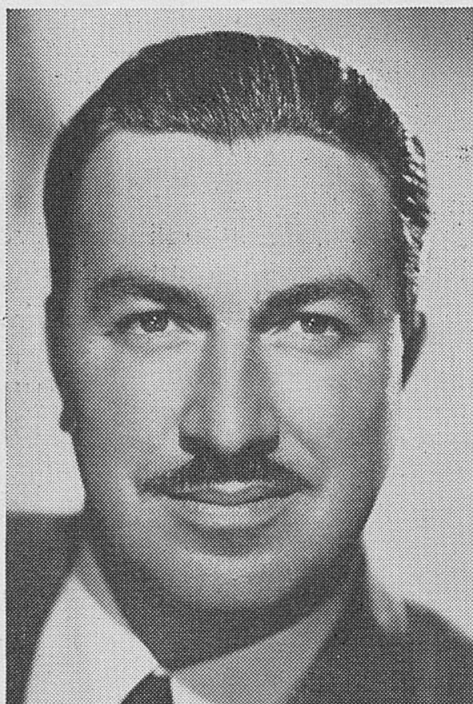
Adam Clayton Powell, Jr. Congressman from New York