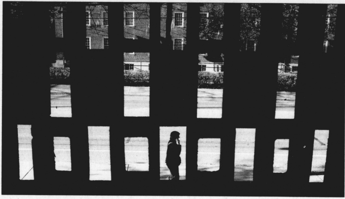
A man talks on his cell phone while walking down Rose Street past Parking Structure #2 yesterday.