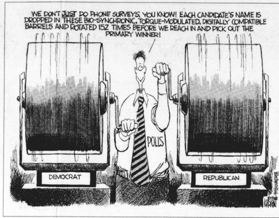
DON WRIGHT, The Palm Beach Post

The road to launching UK Alert has been rocky from the implementation delays to Monday's botched start-up. UK's emergency management staff must make sure these problems do not get in the way of informing the campus about immediate threats.