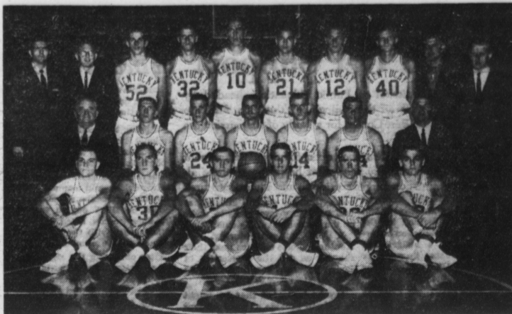
Kentucky Back In Cage Wars Against VMI