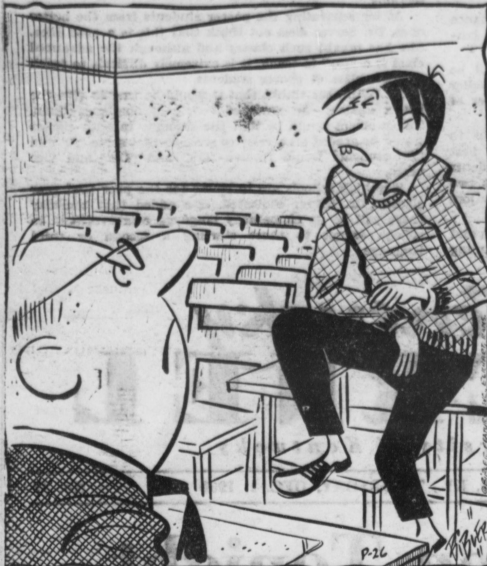
"SO I HAVEN'T BEEN COMING TO CLASS - WHY CAN'T I GET CREDIT FOR THIS AS A CORRESPONDENCE COURSE?"