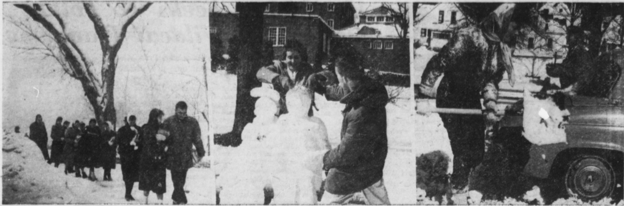
A premonition of the above snow scenes from last winter winds bringing colder weather. Above, students try to remove a snowbound car, have fun building snowmen, and plow across campus in one of Kentucky's heaviest snow falls.