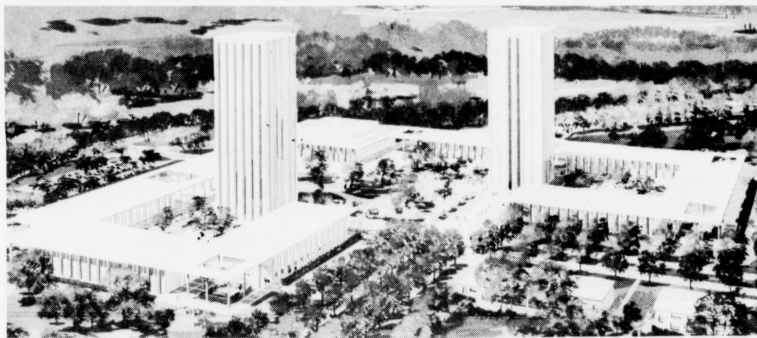
Construction continues (above) at a rapid pace on five low-rise dormitories which were originally scheduled for student occupancy this fall. Below is a scale model of the planned 11-structure complex, which, when complete, will house more than 2,700 students.