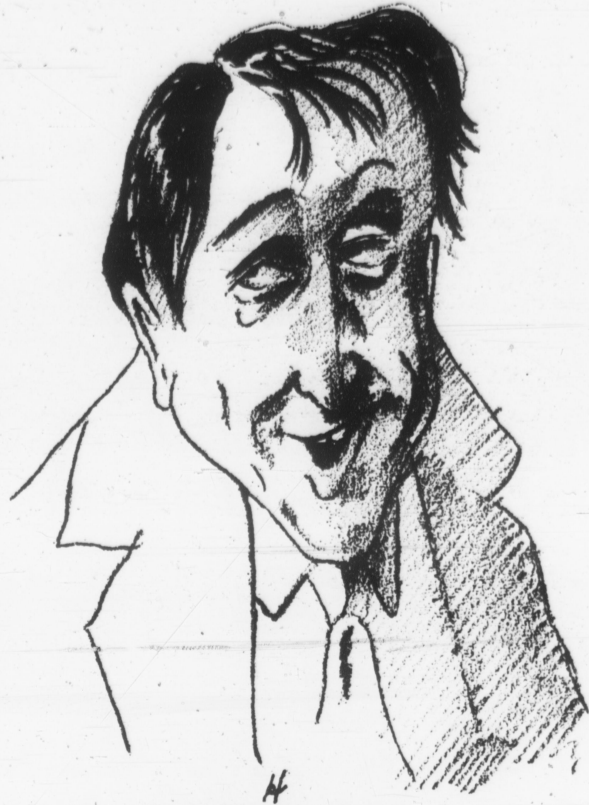
"My Dad Teaches The Course."

The perfect test has not yet been found. This, however, is no excuse for some of the tests we are required to take which are given simply because they are easy to correct. Only when the students can be sure that they are going to be tested on what they know will cheat sheets, fraternity and sorority old-test files and long hours of memorizing material forgotten immediately after the test all disappear.