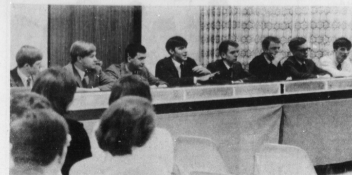
'Well . . . I Think'

Sharp minds over sometimes trivial subjects and ready buzzer fingers, enabled Farmhouse to triumph over the Relativists, 85 to 0, Tuesday night in Round One of the Quiz Bowl. Other victors were: Gamma Phi Beta, Absolutes, Phi Tau, Kappa Sigma, Les Miserables, Excalibur, and YR's.