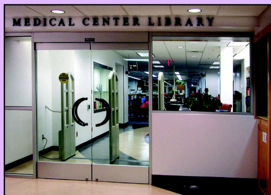
Photo of new MCL entrance shows floor detail that carries design into building hallway.

The renovation is still ongoing as new journal shelving is put up, journals are shifted – both upstairs and downstairs, and staff and users alike adapt to the new look and feel of the venerable old Medical Center Library. One thing hasn't changed – our commitment to providing our users with excellent, personalized, one-on-one service!