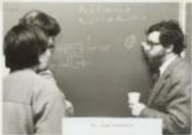
Mr. [Name] [Name]