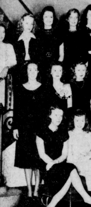
Members of the YWCA Blue Feather membership drive are pictured above. The annual drive is in progress and continues through Tuesday.