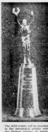
The ATO trophy will be awarded to the intramural athlete with the highest number of points.