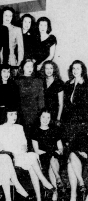
Members of the Tau Sigma fraternity are pictured above. The fraternity is active in various campus activities.

According to William F. Savage, forty-two men have enrolled for flight training.