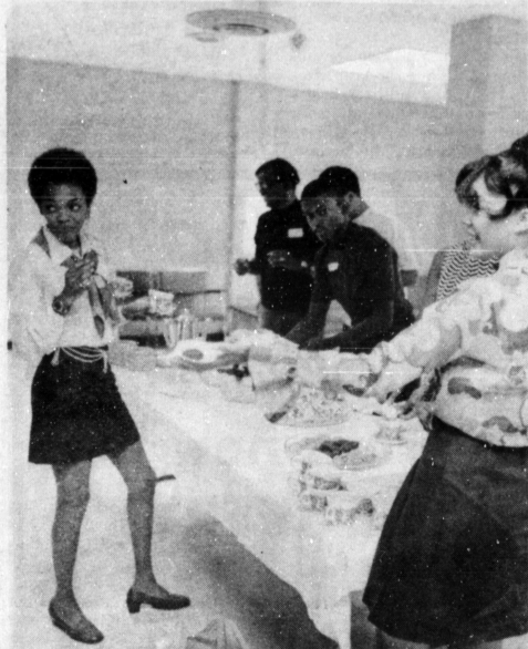
The Black Student Union hosted a reception Tuesday for their old and new members in the Student Center. Good food, interesting conversation and new acquaintances provided an enjoyable afternoon for these UK students.

Further, the foundation agreed to continue to make available to the University at no cost land and property it acquired with administrative expense funds. It also agreed not to sell or encumber those properties without the University's consent and subject to conditions set by Kentucky.