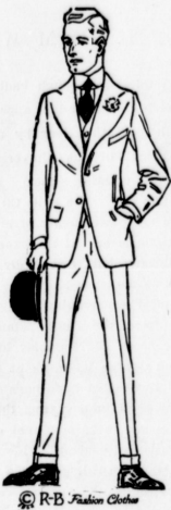
R-B Fashion Cloth