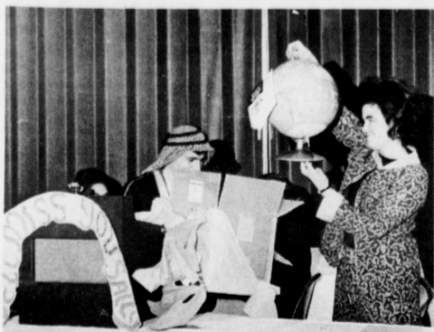
Foreign Student Adviser Honored

Daytona is trying to fight boozers: Page Eight.