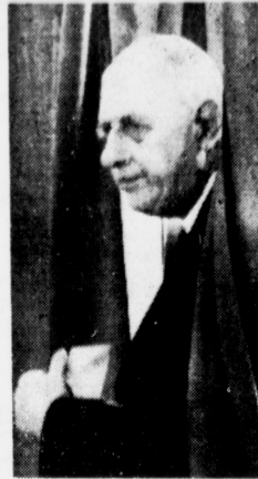
CHARLES DEGAULLE Voting Sunday

slim, there would have been on one side the UNR and its allies and on the other the leftist parties with a middle group led by Jean Lecanuet who was the third active participant in recent presidential elections.