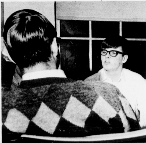
Kernel Photo by Shelby Jett

Notices of status will be mailed, probably by July 31, and those with complete schedules will report on August 28, and incompletes on August 29.