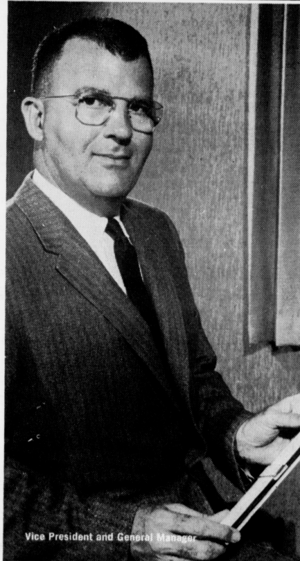
Vice President and General Manager

A new booklet, published by a non-profit educational foundation, tells which career field lets you make the best use of all your college training, including liberal-arts courses—which career field offers 100,000 new jobs every year—which career field produces more corporation presidents than any other—what starting salary you can expect. Just send this ad with your name and address. This 24-page, career-guide booklet, "Opportunities in Selling," will be mailed to you. No cost or obligation. Address: Council on Opportunities, 550 Fifth Ave., New York 36, N. Y.,