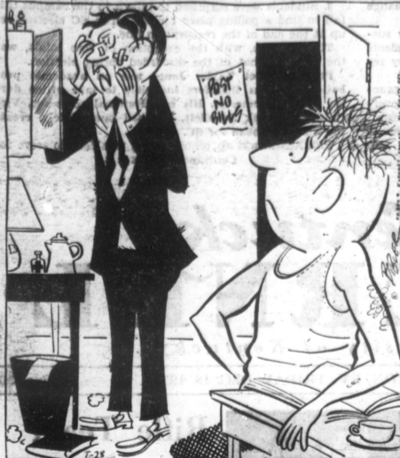
"I SURE AM GLAD I FOUND OUT ABOUT HER! I CAN'T STAND A GIRL THAT'S STRONGER THAN I AM."