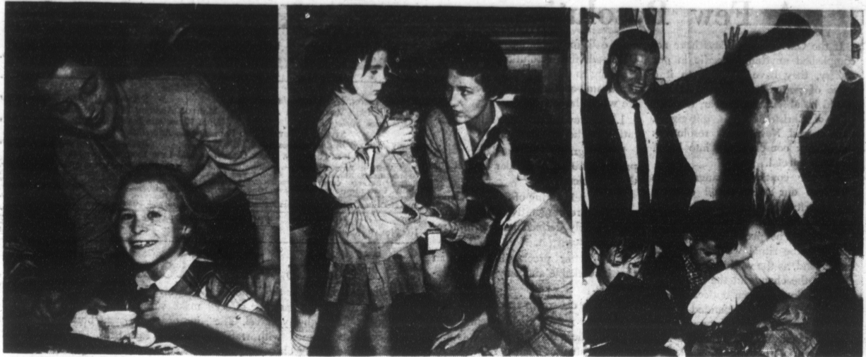
Gee whiz! And ice cream too? I'm having the bestest time, really I am! Look what Santa brought me!