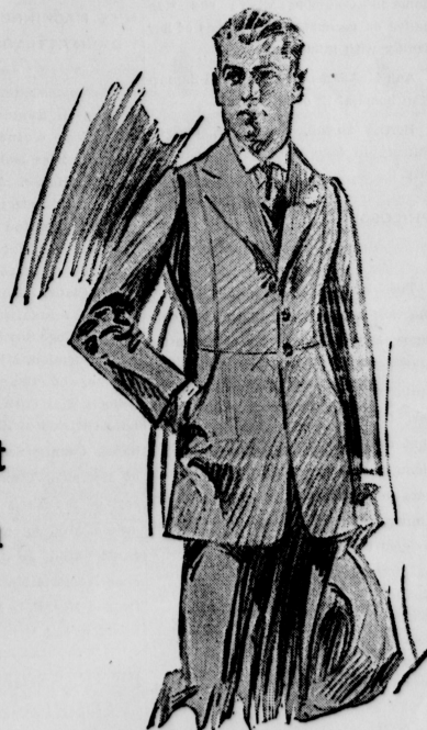
Copyright 1918 Hays, Chaffner & Mann

Ask to See Our New Waist Seam Model Suits