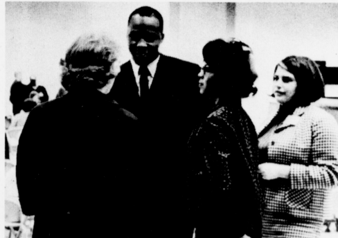
VERNON JORDAN OF ATLANTA AT HUMAN RIGHTS CONFERENCE