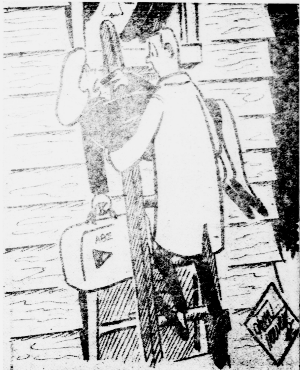
—Syracuse University Daily Orange "Oh Dear! I Forgot To Sign Out!"

At present, the Maintenance and Operations division is doing all it can to convert the old underground wiring method to the direct plug-in method. An instrument which performs this function known as a "628-Relay" has already been placed in White Hall, Barker Hall, and the Administration Building. Plans are also under way to purchase a booster for the present generator which will evenly distribute the time signal to all buildings. Until this comes about, we must be patient and hope for the best.