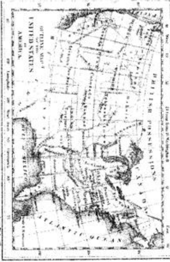
General Scale 1:1,000,000