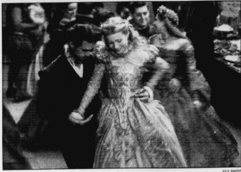
Gwyneth Paltrow and Joseph Fiennes are now dancing to the tune of 13 nominations.