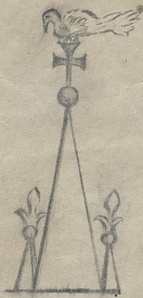
Spire of the church of St. Andrew anno 1498. by 14 of Hen 7

"of length of the bole to the Eagle 20 foote 6 inches of aspen of breadth overwart 6 foote and an halfe of copeffe about of copeffe at the bole 12 foote 2 inches of copeffe of the bole round about 16 foote 5 inches of inner part of the copeffe oake of second part leade of outter, copper gilt with gold of bole & of caples copper and gilt of bole was hollowe and stuffed full of saint's reliques."