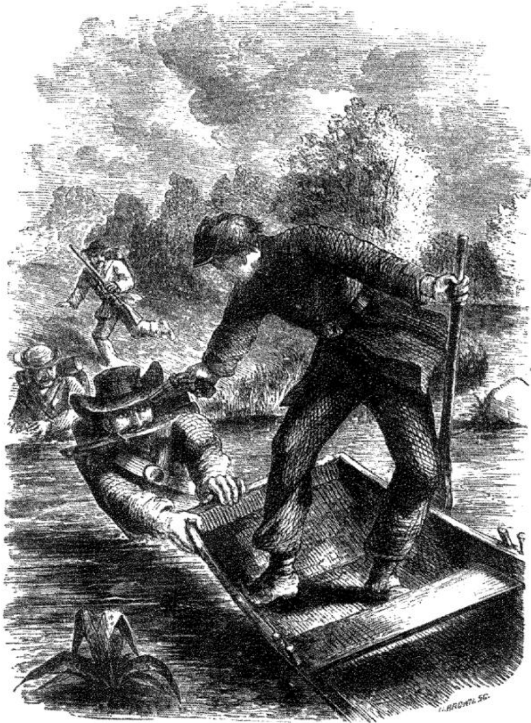
Down the Shenandoah. Page 230