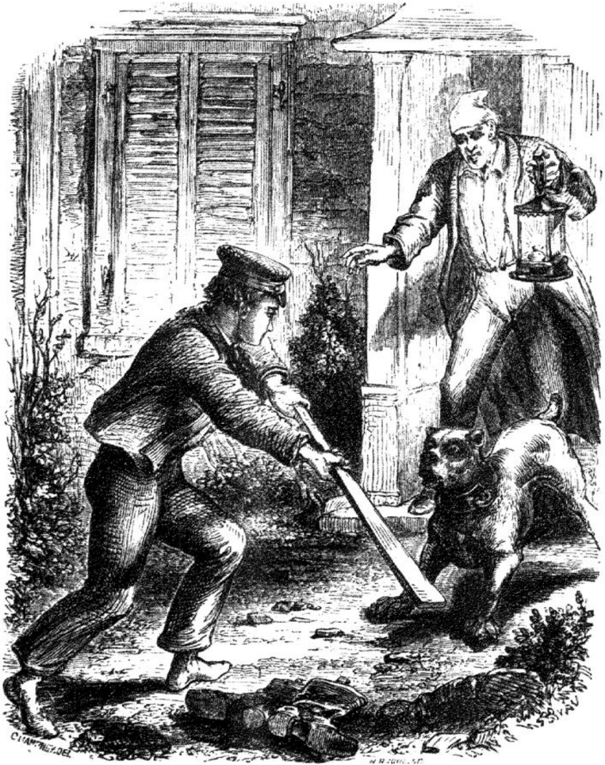
Tom's Battle at Midnight. Page 75.