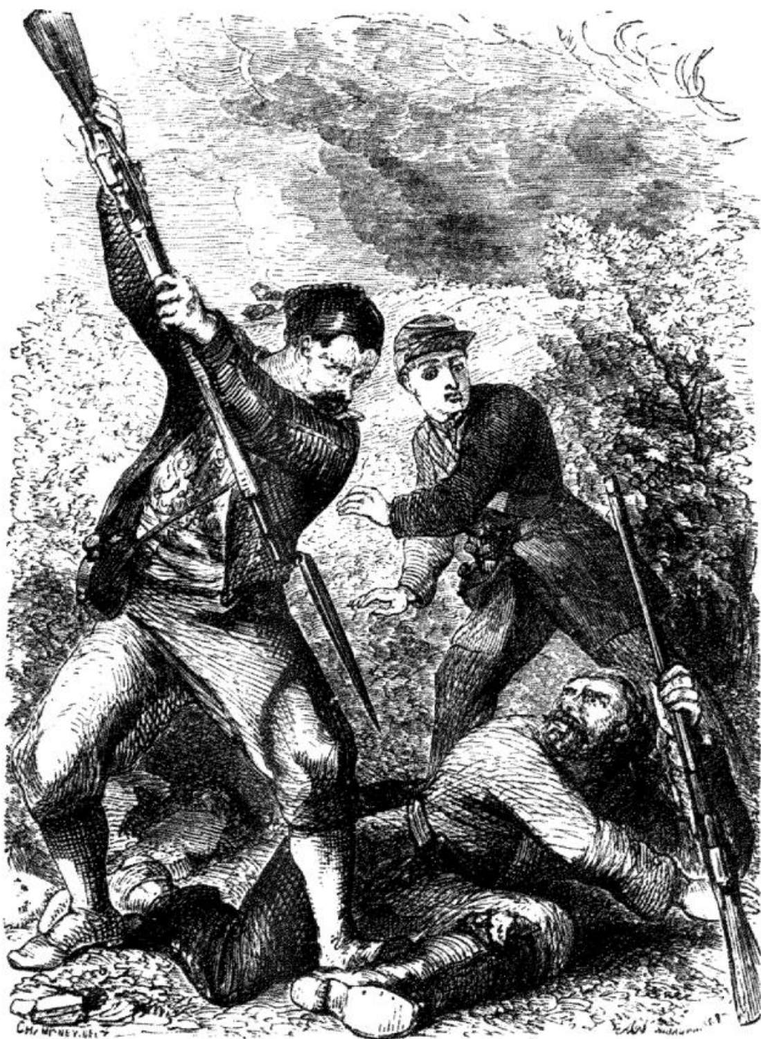
On the Retreat from Bull Run. Page 138.