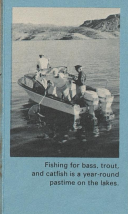
Fishing for bass, trout, and catfish is a year-round pastime on the lakes.

VISITOR SERVICES CHART: The Visitor Center is the place to learn about the park and to begin gathering information about your visit. These developed areas are listed with distances from the Visitor Center.