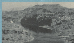
Shadows deepen on the upper reaches of Lake Mohave in the region known as the Black Canyon.

On remote beaches and in the back country away from the developed areas you can find places for more primitive camping. Please bring back your litter in litter containers which you can pick up before you leave at launch ramps and campgrounds. Be alert for flash floods in stormy weather. Avoid wash bottoms, and never camp on low ground.