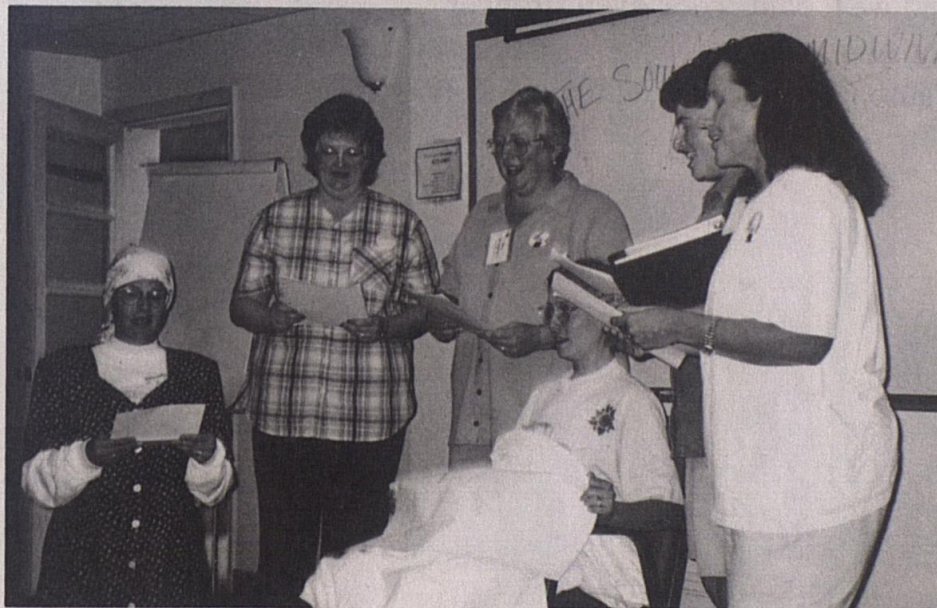
Class 21 "Dark Blue Group"