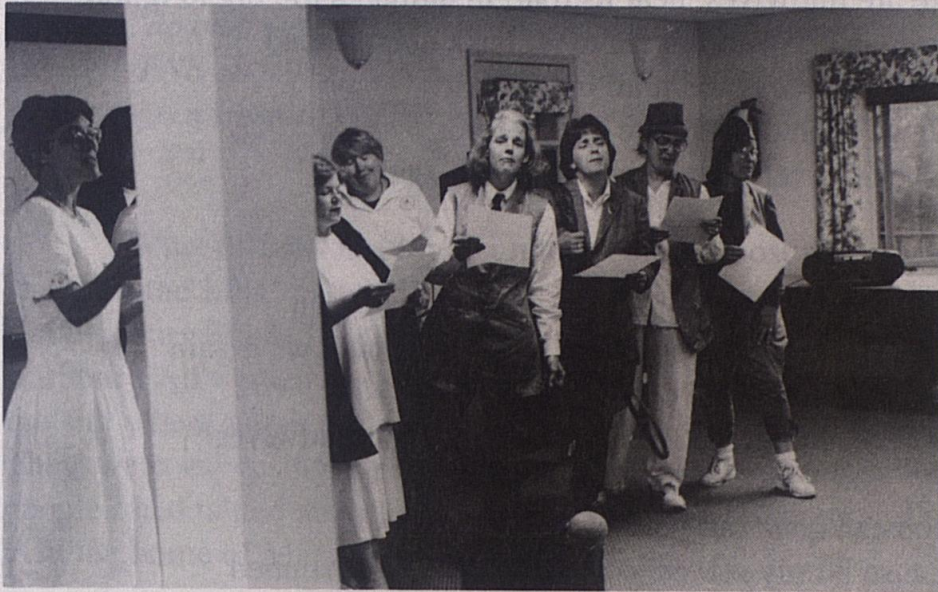
CNEP Faculty "First Midwives Club"

At each CNEP Midwifery Bound, the students are divided into different color groups. At the end of their stay in Hyden, each group presents a skit which are sometimes very humorous to observe. Below are photographs of some of those skits.