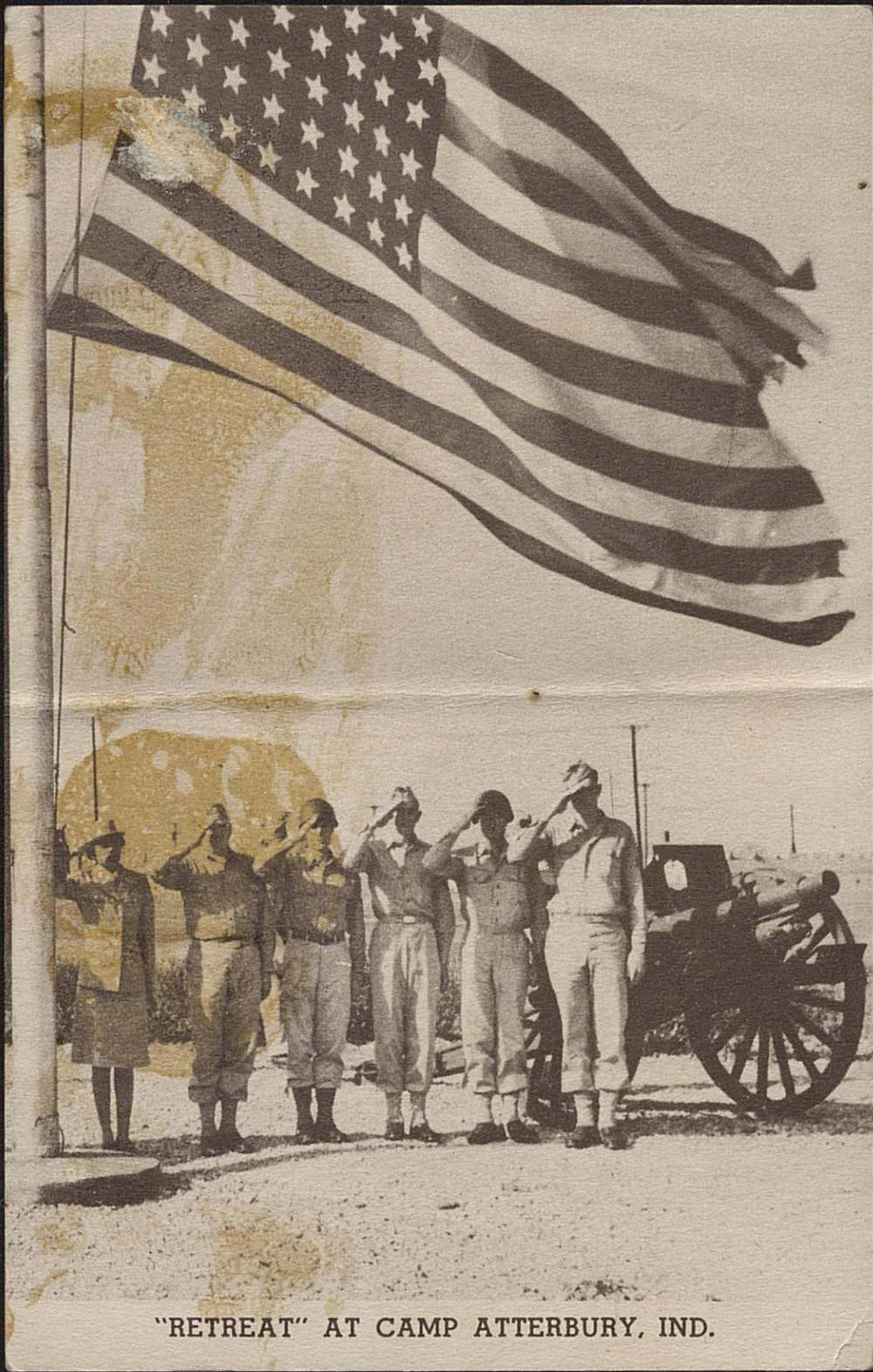
"RETREAT" AT CAMP ATTERBURY, IND.