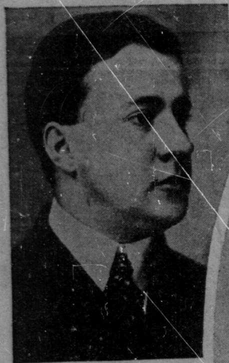
Early in the century.

At a time when service in the United States Senate is more strenuous and exacting than ever before in the history of our country, a Kentucky veteran of many political wars is looking anew toward the corridors of the National Capitol, where he perceives the development of critical issues with which he has concerned himself throughout all his lengthy political career. John Crepps Eckliffe Beckham, former Governor and United States Senator, going before the people of Kentucky once more as a candidate of the Democratic Senatorial Fraternity.