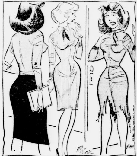
"I MADE THE MISTAKE OF LETTING HIM SHOW ME THE SIGMA PHI NOTHING SECRET HAND CLASP."