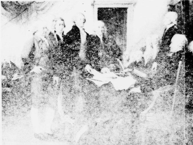
This is only one of the many important scenes in the history of our country which Page Smith captures in his historical work, "John Adams." It is the drafters of the Declaration of Independence submitting the document to Congress—from a painting by John Trumbull. Standing are, from

Joseph Heller takes the typical war novel and makes an exciting, tremendously funny story out of it.