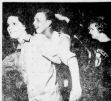
into full swing on the Row the Kappa Sigs had their annual gross party. Looks like it was a good weekend for all.