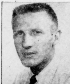
JIM HAMPTON Documented The Fraud