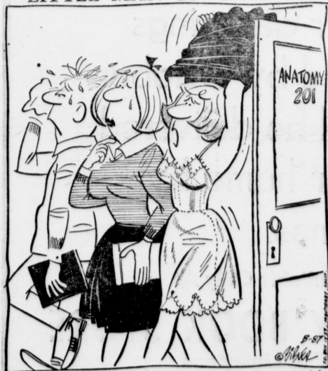
"I DO BELIEVE IT'S TH' HARDEST EXAM HE'S EVER GIVEN US."