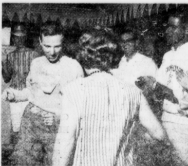
the typical rush picture prevailed with the women sitting on the floor passing cigarettes and chatter to the attentive men. Breaking into the weekend scene the men of FarmHouse had a swinging time at their come as you've always wanted to be party. And further on as rush got