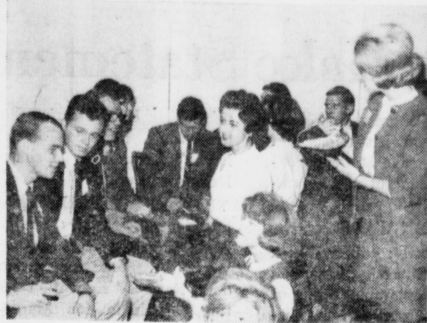
Last Thursday the SAE's had a unique privilege. They were allowed to watch a sorority rotation system in operation. The event was a dessert with the Alpha Xi's. The women rushed the frat men before a jam session at the Alpha Xi house. Name tags were worn by everyone and