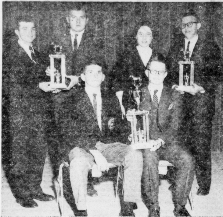
Thoroughbred Debate Winners