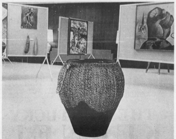
On exhibit in the Student Center, this African wedding drum carries out the theme of the show, Beauty of Blackness . In addition to the drum, several Black-oriented paintings highlight the show. African native masks and utensils are also featured in the display. They are part of the BSU week-long Arts Festival.