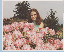
Ronan Mountain straddles the Tennessee-North Carolina line and each June (May in some years) becomes a field of color. The rhododendron gardens on the mountain make a colorful scene which attracts visitors from all over the nation.