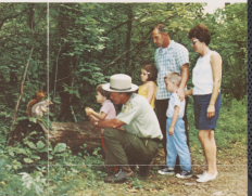
The Forest is for learning also. A Ranger shows visitors a squirrel and tells them how squirrels live and find food and a home among the trees.