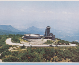
High atop Brasstown Bald in Georgia is a Visitor Center and fire tower. One of several in the Southern National Forests, the Visitor Center offers a commanding view of the mountain forests of Georgia and surrounding states.

U. S. DEPARTMENT OF AGRICULTURE FOREST SERVICE - SOUTHERN REGION 63361 12-1474-66