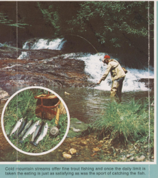
Cool mountain streams offer fine trout fishing and once the daily meal is taken the setting is just as satisfying as was the sport of catching the fish.

The magic touch of nature in all the seasons.