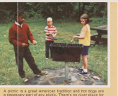
A picnic is a great American habit and the days are filled with it. Here the forest provides the perfect place for such a picnic. There is no need for a picnic table.