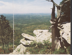
The quiet beauty of the land beyond can be seen from this point on the Tallapoosa State Drive (under construction) in Alabama.

These Forests are your Forests, leading you to enjoy their beauty and their outdoor whenever and wherever the mood strikes you.