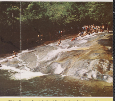
Sliding Rock on Pisgah National Forest in North Carolina furnishes fun and profits for thousands of persons, old and young, each year.