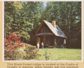
This Black Forest Lodge is located in the Circle of Forests in America where forestry was first practiced in the country.

The beckoning lands of the National Forests in the South offer many things. A chance to explore quiet woodland ways... a chance to enjoy nature and learn more about it at the same time... a chance to sit beside a rushing mountain stream. And the opportunity to get away from the hectic life of a city and take in the beauty and quiet of the forests.