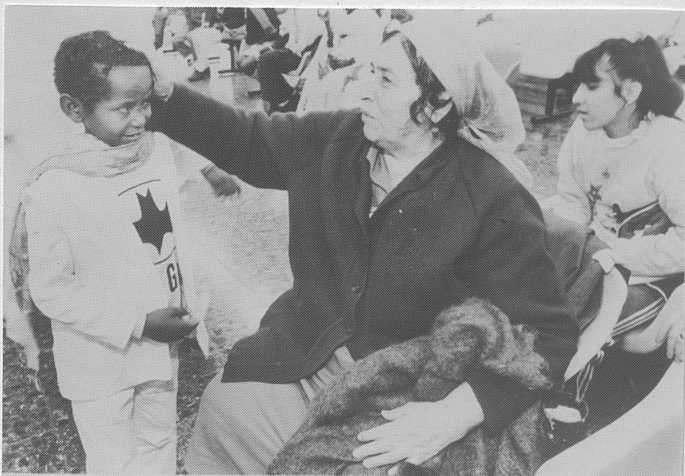
New Israelis —A Soviet Jew reaches out to a young Ethiopian Jew at Israel's Ben-Gurion Airport. Both arrived in Israel thanks to UJA.