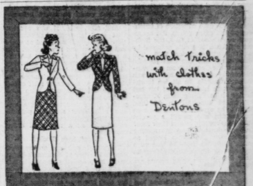
match tricks with clothes from Denions

EXCLUSIVE FURS FURS EXCLUSIVELY LOWENTHAL'S Furriers Since 1899 Home of "Heart of the Pel" Furs