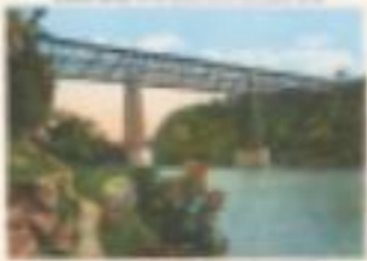
BRIDGE OVER THE RIVER, [illegible]