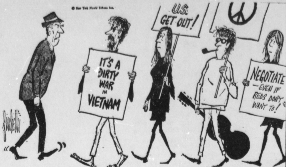
—Fischetti in the New York Herald-Tribune

dom which appear at the first of this editorial were spoken in 1953 by Andrei Vishinsky in explaining the meaning of Soviet freedom of the press.