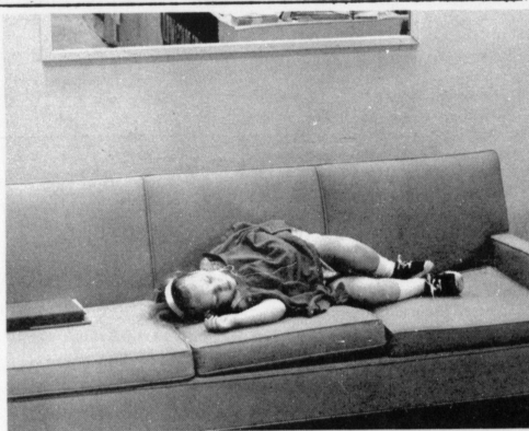
—The Kentucky Kernel

Tickets are available from the Horse Show Office at the Trotting Track and at the gate each night. The evening performance begins at 7:30.