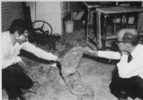
Bread is art

Bread is an excellent fine art medium, Fischer says, and as far