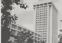
PATTERSON OFFICE TOWER —The 19-story tower houses more than 1,000 faculty members, primarily in Arts and Sciences, Library Science, Social Professions, Student Affairs, and the Patterson School of Diplomacy. The top floor has well-appointed meeting and conference rooms, lounges, and an observation area. The WHITE HALL CLASSROOM BUILDING adjoining the Patterson Tower with both underground and above ground walkways, features large modern classrooms which accommodate nearly 4,000 students. It is one of the largest structures of its kind in the nation.