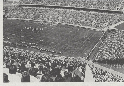
COMMONWEALTH STADIUM —Featuring the latest of stadium designs, the huge steel and concrete superstructure will be the home of the Wildcats for years to come. A gently curved seating facility with twin cantilevered decks provides a spectacular view of the turf section for some 54,000 fans from nearly any point on the field. The facility also contains well-appointed offices for coaches and staff.