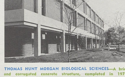
THOMAS HUNT MORGAN BIOLOGICAL SCIENCES —A brick and concrete structure, completed in 1974, features laboratory, lecture, seminar, and study rooms and equipment for the study and teaching of plant and animal life processes. Research facilities, including advanced lighting in the foyer, makes an attractive setting for educational endeavors of both students and faculty.