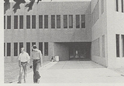
DON CASH SEATON SPORTS CENTER —A geometrically-designed building erected in the early 1970's—one of the most unique structures of its kind in the nation—features a large, versatile gym that accommodates several team sports simultaneously, handball courts, physical fitness rooms, research lab, office and classrooms. With bright, attractive decor, and well-equipped with body-building devices, the center is one of the most-used buildings on campus.