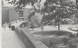
STUDENT CENTER —This low level building with bookstore is one of the most popular spots on campus. It has lounge, meal, snack, club and student rooms, game rooms, cinema and a gallery.