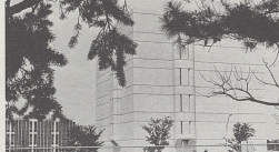
AGRICULTURAL SCIENCE CENTER —Completed in 1972, Ag Science South, a solid concrete structure, is windowless on two sides. Primarily for animal science faculty and students, it accommodates half offices and half labs in the central core. AG SCIENCE NORTH , brick with solar panels, is designed primarily for plant science faculty and students; contains a library, hexagon-shaped auditorium, the National Botanic Research and several administrative offices.