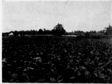
FIELD OF BURLEY TOBACCO