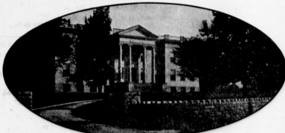
FRONT VIEW, KENTUCKY AGRICULTURAL EXPERIMENT STATION.