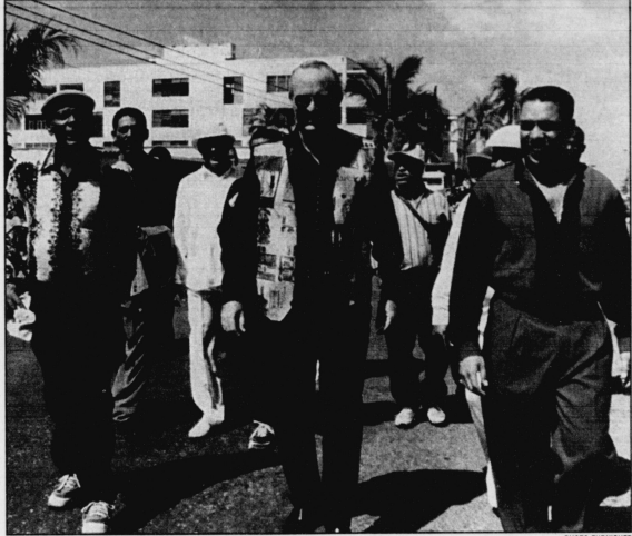
iCubanismo! will play tunes from their latest album, Reencarnación, when it visits UK Sunday. The group is considered one of the most famous Afro-Cuban bands in the world.

"So we're getting a chance to see more of these groups perform here, which is fantastic. It's really a matter of cultural exchange preceding