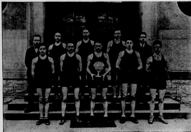
THE 1924 BLUE DEVILS