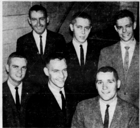
Lamp And Cross

The AWS steering committee, composed of representatives from every University women's organization, has been planning the structure and functions of the new government since early in the year.