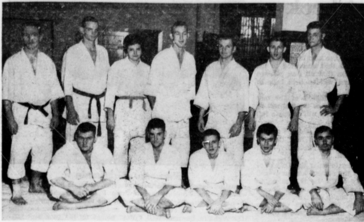
Kentucky Judo Team