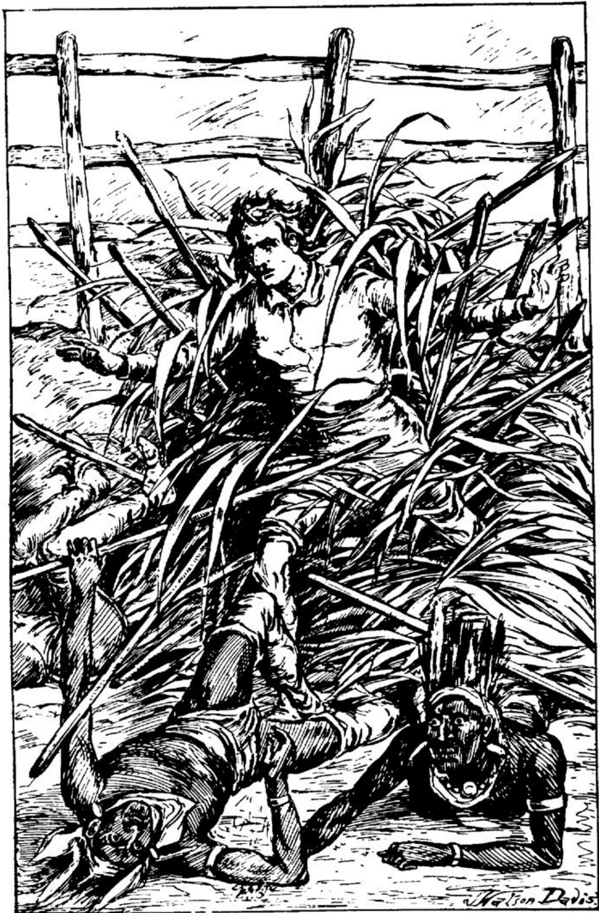
An old stratagem used by Boone to escape the Indians. — Page 156.