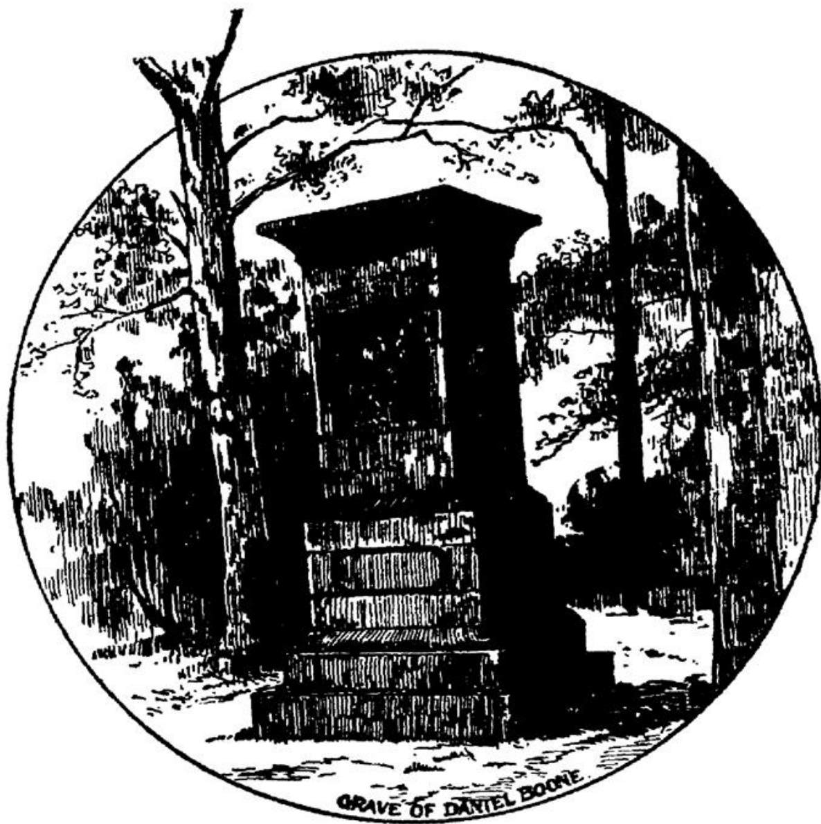
The remains of Daniel Boone and his wife were re-interred in the cemetery at Frankfort, Kentucky, on August 20th, 1845.—Page 353. Daniel Boone.