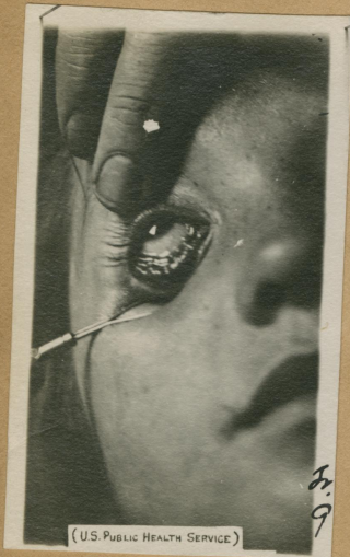
Acute trachoma involving lower lid, with abundant trachoma bodies.