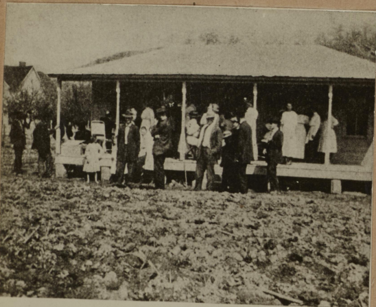
Fig. 1. Trachoma clinic held at Oneida, Ky.