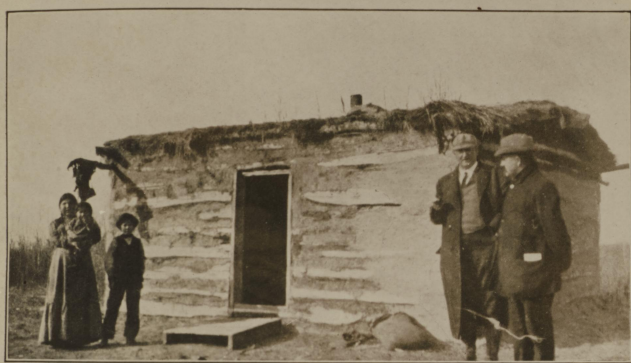
FIG. 17.—SEVEN PEOPLE WITH SIX CASES OF TRACHOMA LIVED IN THIS HOUSE. IT HAS NO WINDOWS.