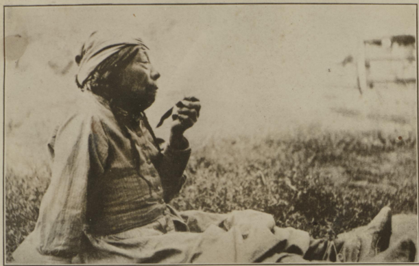
FIG. 8.—ONE OF THE MANY SUFFERERS FROM TRACHOMA NOW PARTIALLY BLIND. (PHOTO BY AN INDIAN ARTIST.)