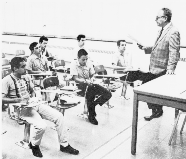
Let's Speak English? Si!