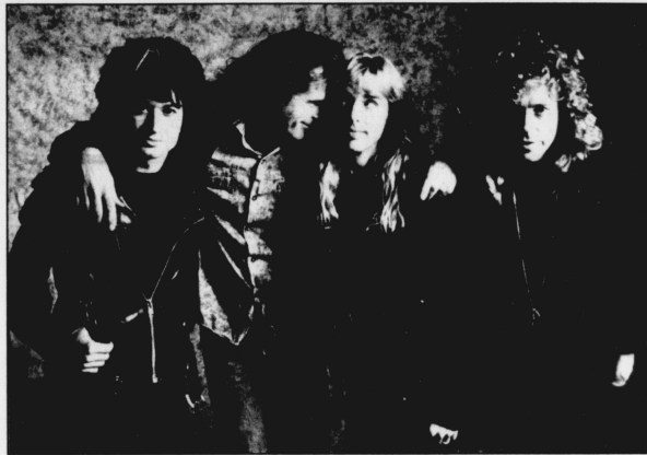
Damn Yankees will open tonight for Bad Company, a 7:30 concert at Rupp Arena. Damn Yankees' self-titled album released last year scored a modest hit on the charts. From left, the band is Michael Cartellone (drums), Ted Nugent (guitar/vocals), Tommy Shaw, formerly of Styx (guitar/vocals) and Jack Blades, formerly of Night Ranger, (drums and vocals).