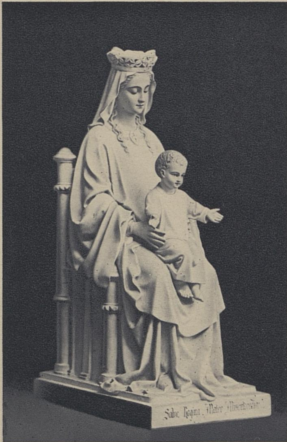
Abbaye Grande Trappe (Orne)